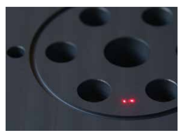
Twin beams for easy focus finding