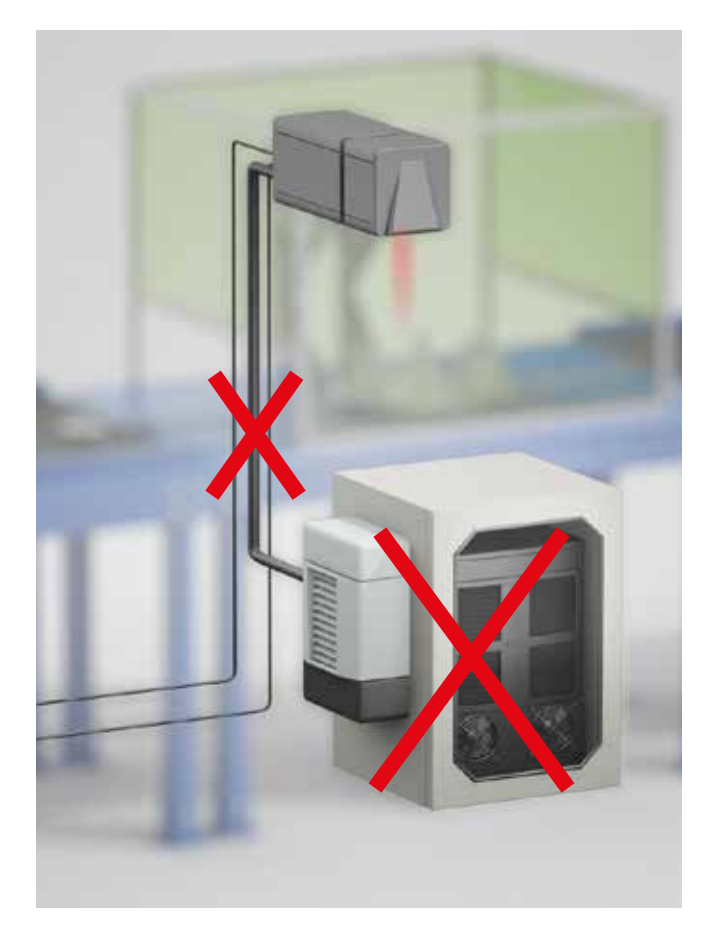
UniQ<sup>™</sup> does not require any additional external unit. Integration in production lines is simple and quick and involves only power supply, Ethernet and I/O signals.