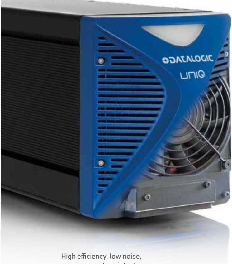
environment-resistant, air cooling system - (patent pending)

All laser sources described in this product guide are Class 4 laser sources. Laser interaction with organic or inorganic material can cause TOXIC FUMES/PARTICLES. The OEM laser components described in this product guide is for sale solely to qualified manufacturers, who shall provide interlocks, indicators and other appropriate safety features in full compliance with applicable national and local regulations.